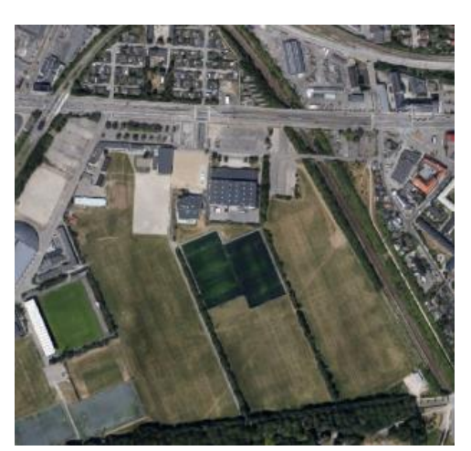
Valby Idrætspark Julius Andersens Vej 1 2450 København